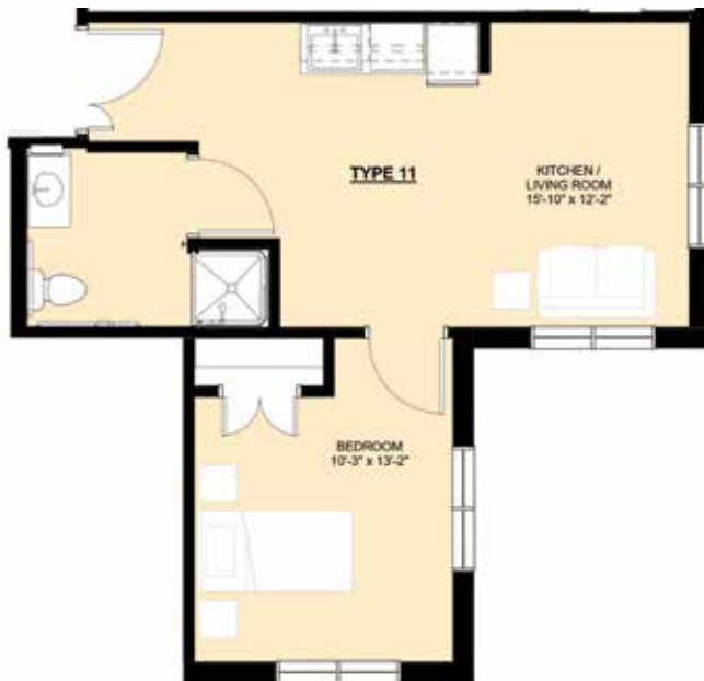
One Bedroom — 453 Square Feet

Plans are approximate and subject to change