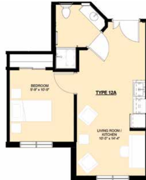
One Bedroom — 408 Square Feet