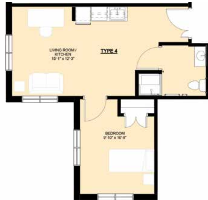
One Bedroom — 440 Square Feet