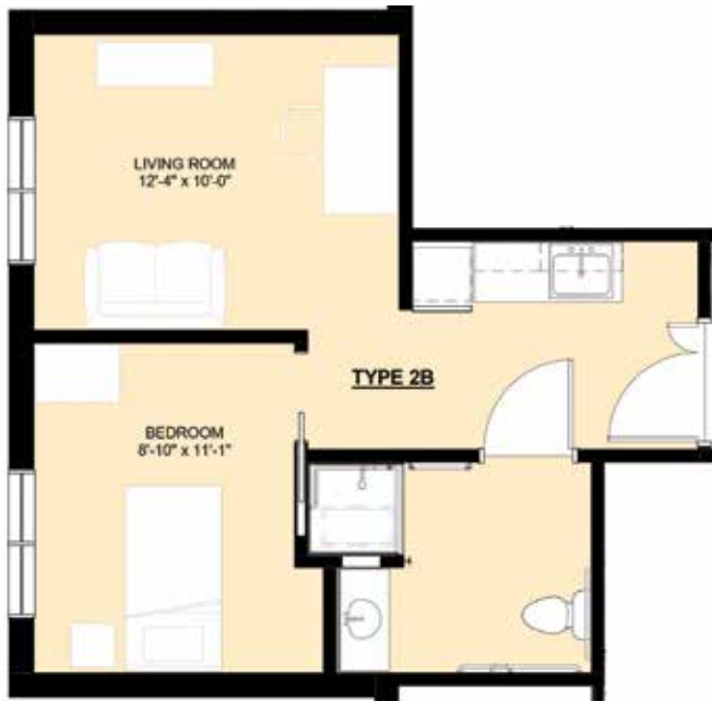
One Bedroom — 386 Square Feet

Plans are approximate and subject to change