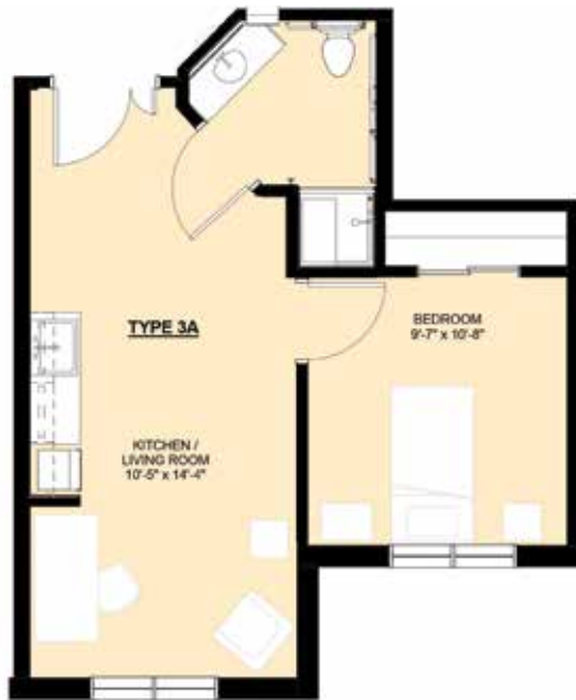
One Bedroom — 407 Square Feet

Plans are approximate and subject to change