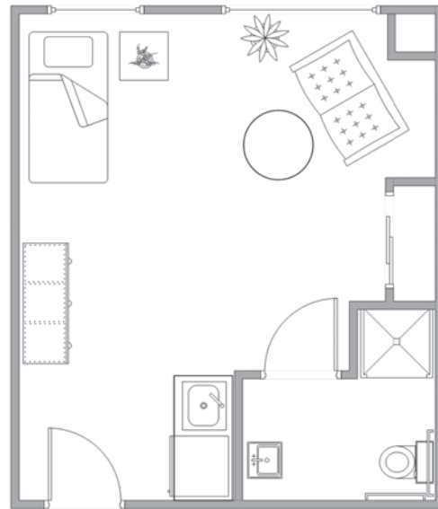
Deluxe Studio with Kitchen 353 - 416 sq. ft.